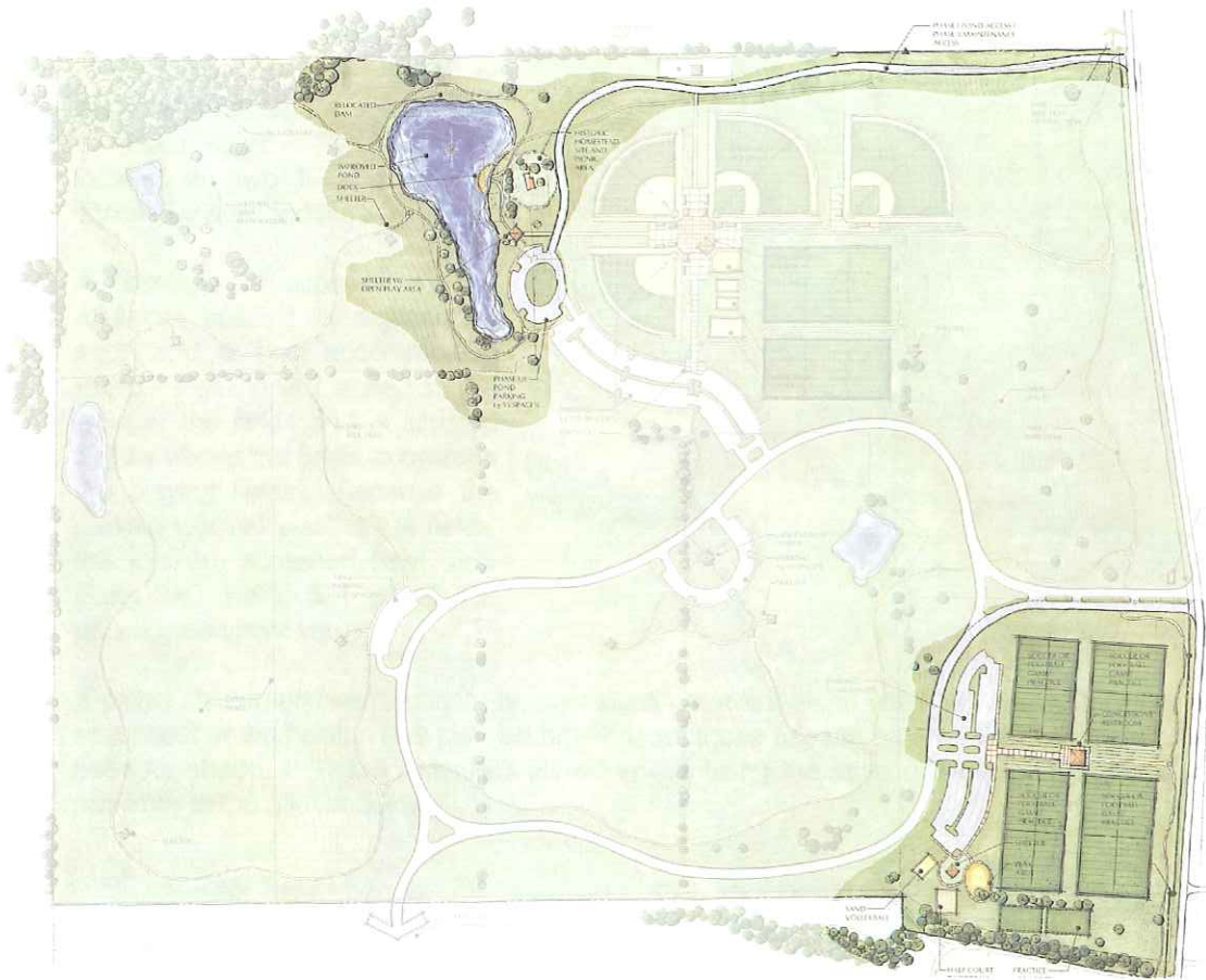
Phase I Master Plan Overview